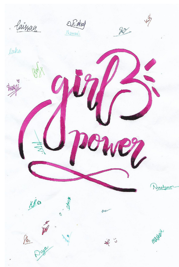
Grade 6 Students

Be proud to be a women, because women are warriors fighting societies standards every day and night. So as women we shall stand and take our stance; we shall show them what we're really worth, because we are women, and this is our story.